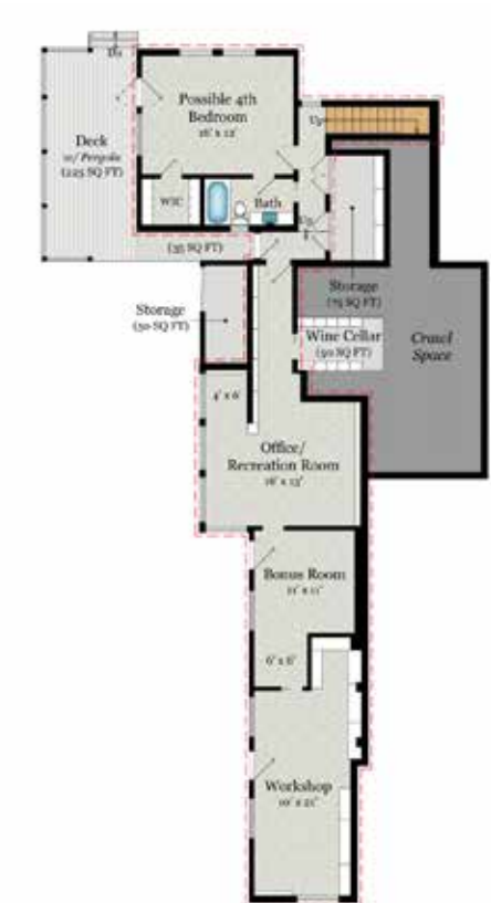
LOWER LEVEL 1,225 SQ FT