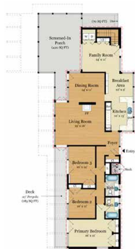
MAIN LEVEL 1,780 SQ FT