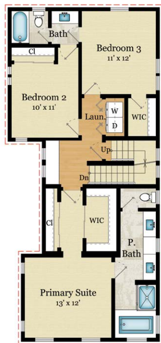
UPPER LEVEL 1 985 SQ FT