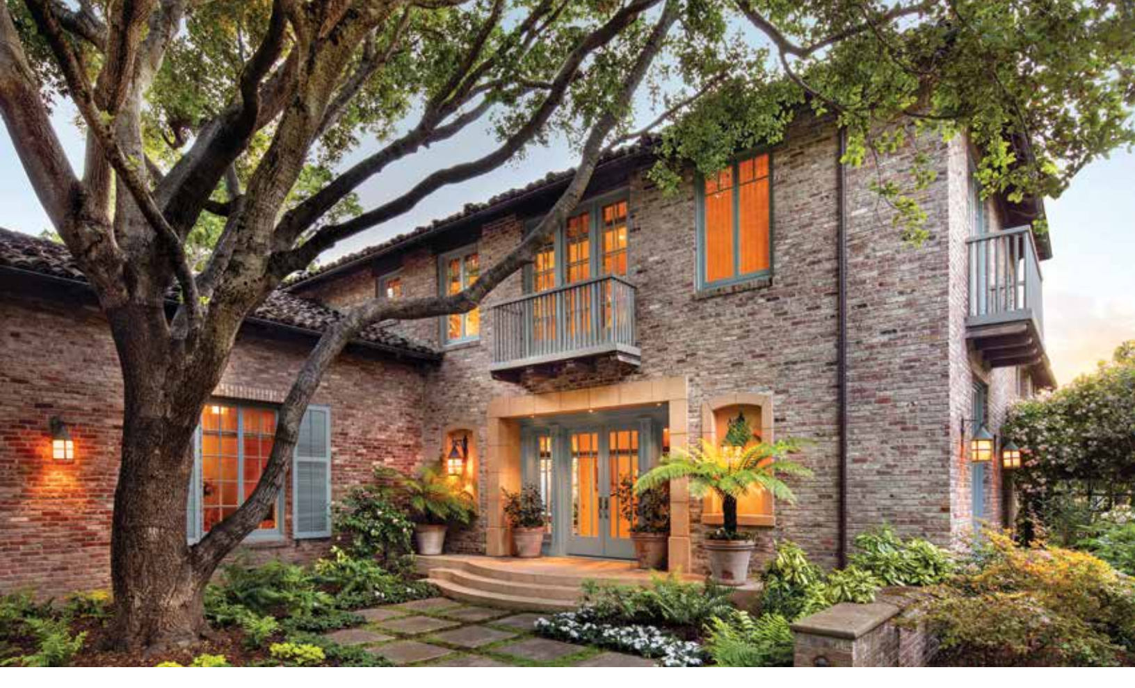
30 ATHERTON AVENUE, ATHERTON ATHERTON ESTATE ON 3.17 ACRES WITH EXTRAORDINARY GROUNDS