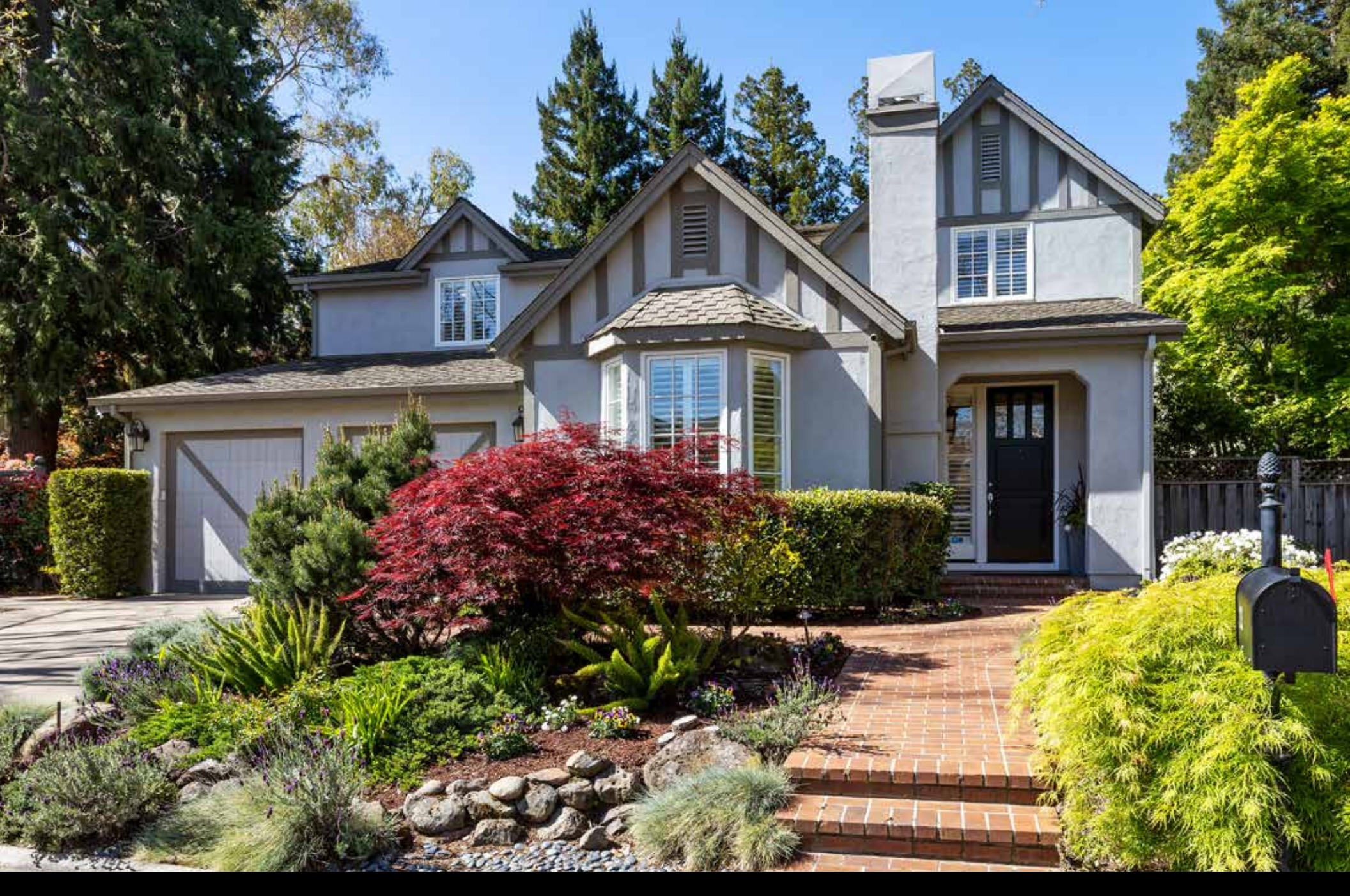
REMODELED TURN-KEY HOME IN DESIRABLE VINTAGE OAKS