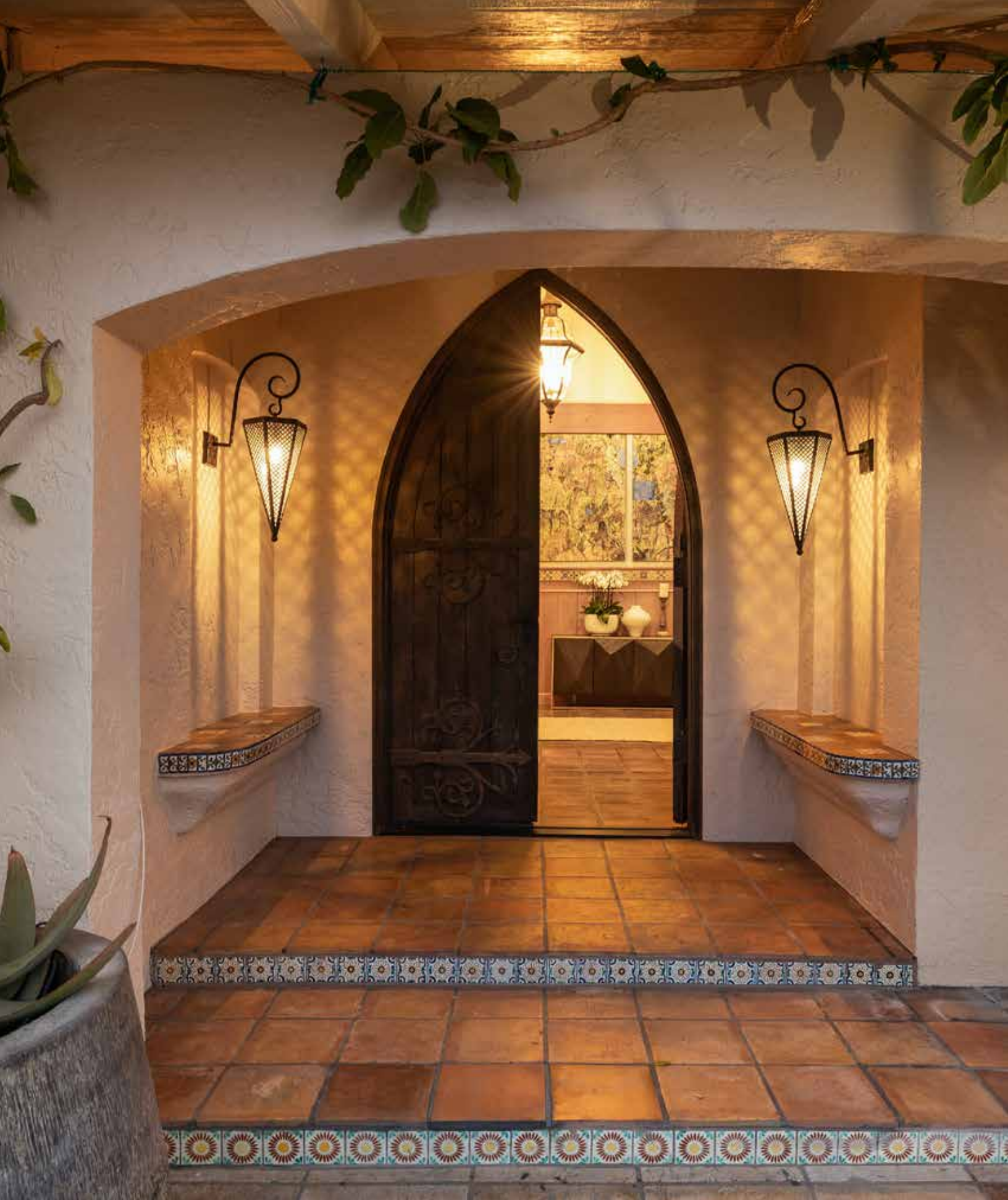
155 BEAR GULCH DRIVE, PORTOLA VALLEY