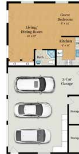
GUEST HOUSE/ DETACHED GARAGE