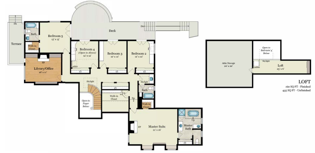
UPPER LEVEL 2,175 SQ FT