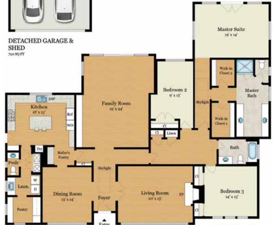
MAIN RESIDENCE 2,980 SQ FT