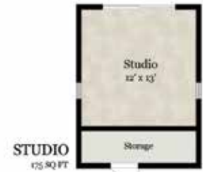
STUDIO 175 SQ FT